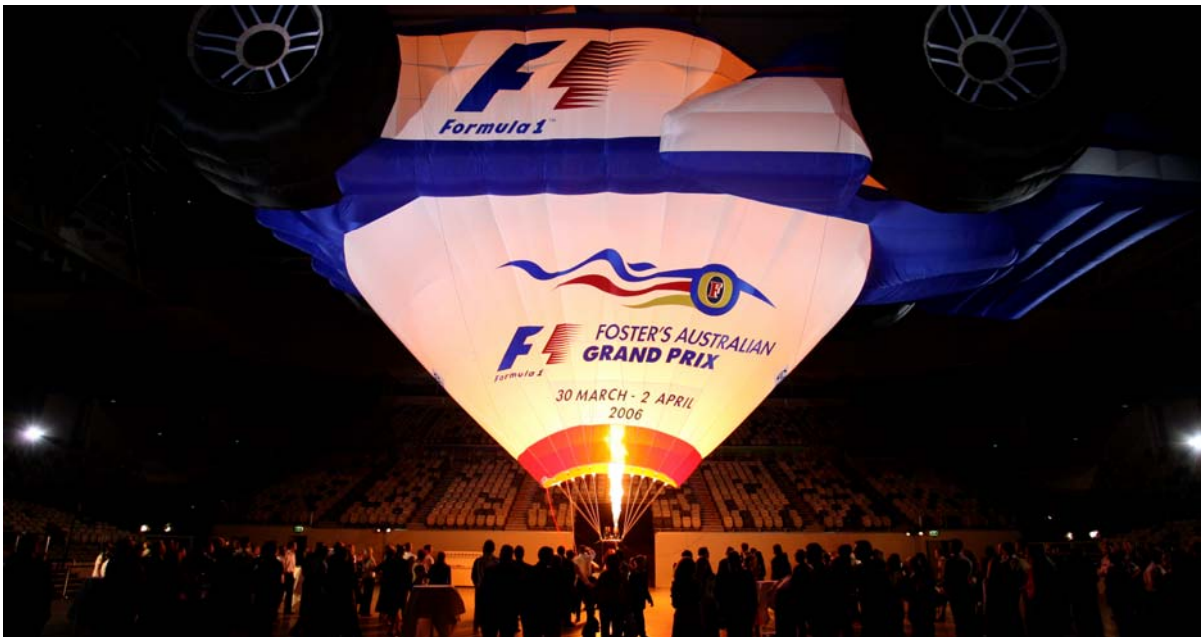
Top: AGPC’s Tim Bamford addresses the audience in the specially created room with it’s own PA, lighting and projection. When the room ‘lifted-off’ the audience were greeted with spectacular effects and the Foster’s Australian Grand Prix balloon in its magnificence.